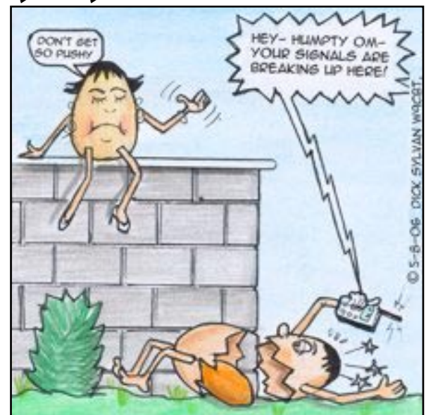
HUMPTY DUMPTY HAD A GREAT FALL