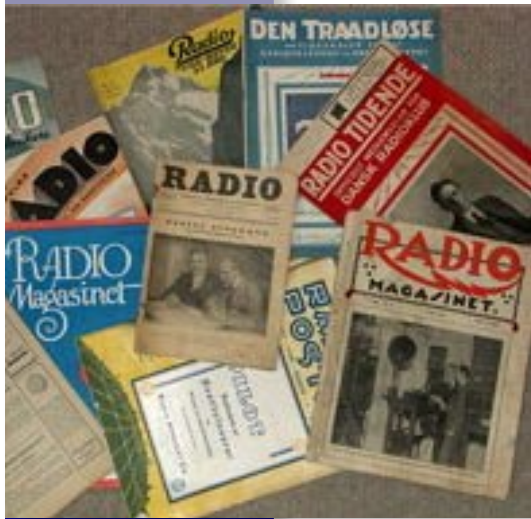
A Small Sample of Gorm's Collection

I started collecting old books and magazines about radio technique about 40 years ago. With the help of many good friends and by advertising in the Danish ham radio magazine OZI now have a fine collection of 1,013 books and 8,485 magazines. It is my interest in radio that made me start collecting and I think it is interesting to follow the evolution of radio technique from its very beginning to now.