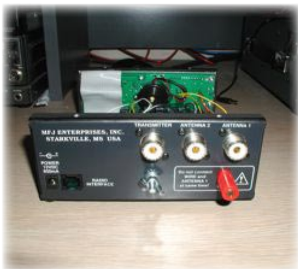
Rear View of MFJ-929 Intellituner