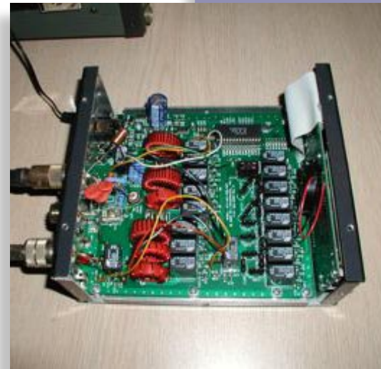
Top View of MFJ-929 with Cover Removed

The MFJ-929 Intellituner is manufactured by MFJ Enterprises, Inc. PO Box 494, Mississippi State, MS 39762. http://www.mfjenterprises.com M.S.R.P. $219.95.