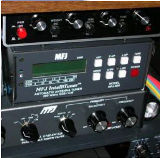
MFJ-929 Intellituner at ARS W9CBT