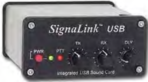
TigerTronics Signalink USB Digital Interface

In the past, I've talked about digital modes in amateur radio, such as PSK-31, Hell Schreiber and Olivia in its different incarnations. There are some real advantages to the digital modes: